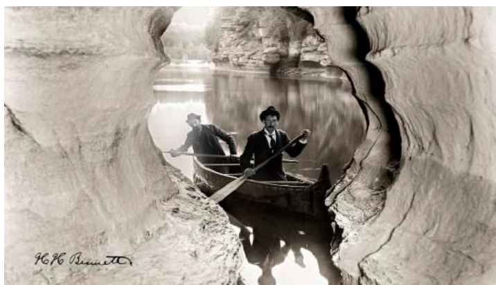
Looking Out Boat Cave Two men navigate a canoe along the other side of a “cave” on the Wisconsin River. H. H. Bennett had difficulties with this shot as his subject kept resulting as shadowy blurs. He took extreme measures to ensure he had enough light and definition- he whitewashed the rocks to create more illumination.

Add Sliced Ham – $5 per guest Add Sliced Turkey – $5 per guest Add Sliced Roast Beef – $10 per guest Add Chef Carved Prime Rib Au Jus – $18 Add Chef Carved Medium Rare Tenderloin – $12