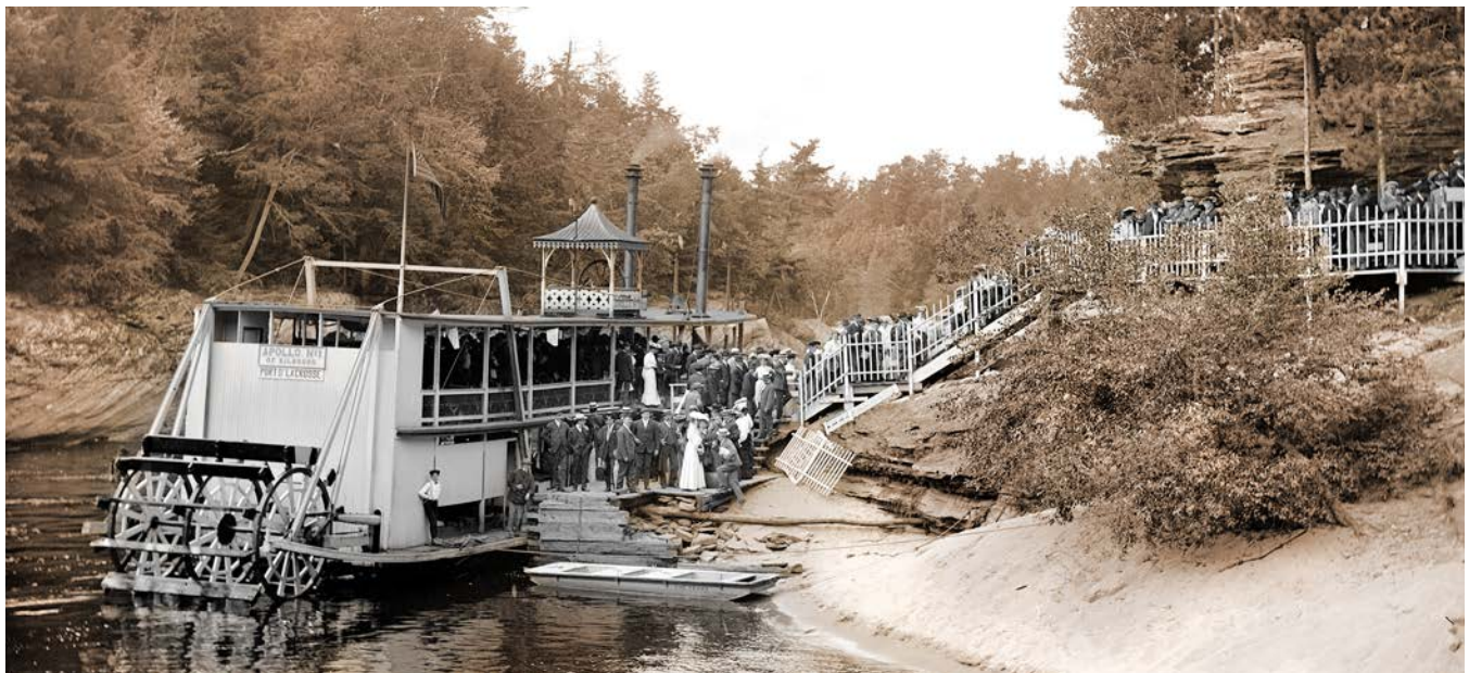
“Apollo #1 Steamboat at Larks Hotel Landing” The steamboat APOLLO was built in 1898 and showed visitors the wonders of the Wisconsin River at the Dells for over 30 years. She sank in 1931. The Larks Hotel was located just south of Chula Vista Resort.

Items from the A La Carte Hot and Cold Hors d'oeuvres section (page 13) can be added to any of the above basic packages. (as an example, when you choose the Medium Appetizer menu, the resort prepares 8 appetizers per guest on your guaranteed count) (8 appetizers x 50 guest guarantee = 400 appetizers prepared)