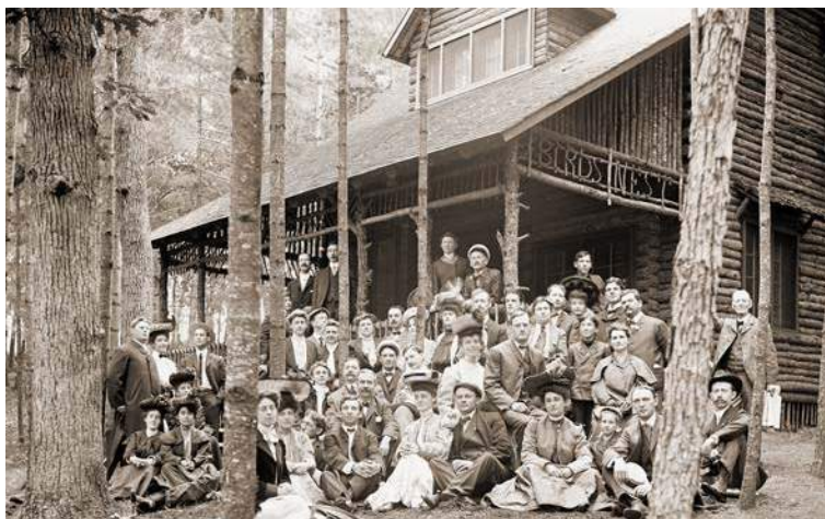
The Bird's Nest "At the Dells" A large group assembled on the porch of one of the many quaint resort 'cottages' which dotted the river to serve the visiting public at the turn of the 20th Century. Bennett would often take a group photograph, then have prints available at his studio when they returned to Kilbourn City. The Bird's Nest is immediately adjacent at the south end of Chula Vista Resort and still stands intact today.

Thinly sliced smoked ham piled high with pickled red onion, feta cheese, black olive, shredded romaine, diced tomato and served with red pepper cream mayo.