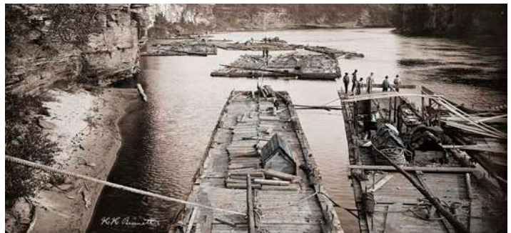
The Fleet Just Below The Dam In The Dells Raftsman's Series No. 1403 Multiple rafts are loaded with felled trees to move along the river. Rafts like this were barge-like in size and shape. They required experts to navigate them, especially along tricky areas of the river and held large quantities of timber and men.