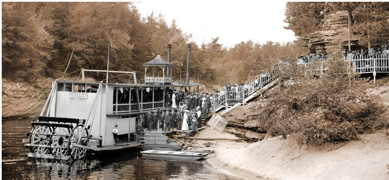
“Apollo #1 Steamboat at Larks Hotel Landing” The steamboat APOLLO was built in 1898 and showed visitors the wonders of the Wisconsin River at the Dells for over 30 years. She sank in 1931. The Larks Hotel was located just south of Chula Vista Resort.

Items from the A La Carte Hot and Cold Hors d'oeuvres section (page 13) can be added to any of the above basic packages. (as an example, when you choose the Medium Appetizer menu, the resort prepares 8 appetizers per guest on your guaranteed count) (8 appetizers x 50 guest guarantee = 400 appetizers prepared)