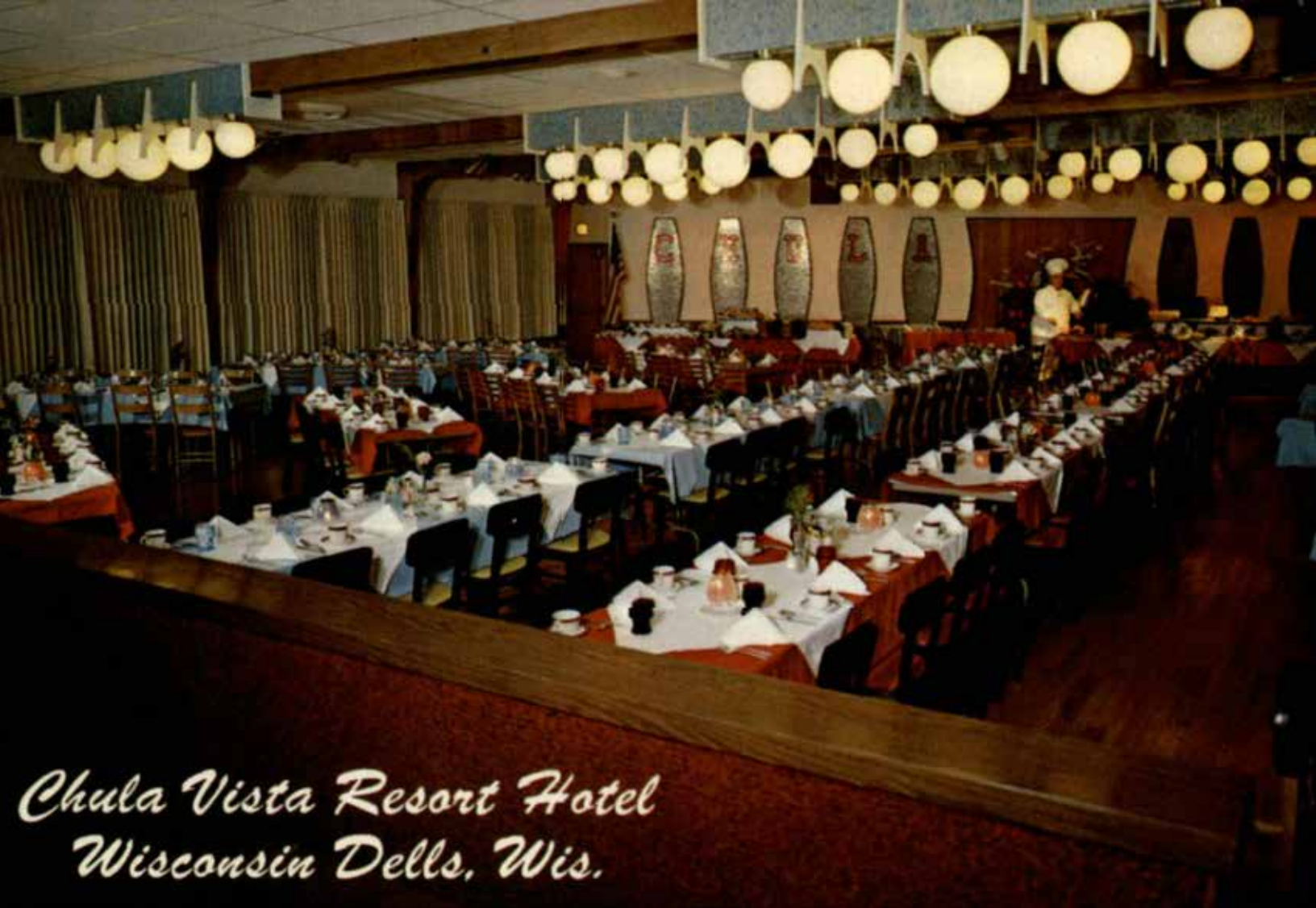
Chula Vista Resort Hotel Wisconsin Dells, Wis.