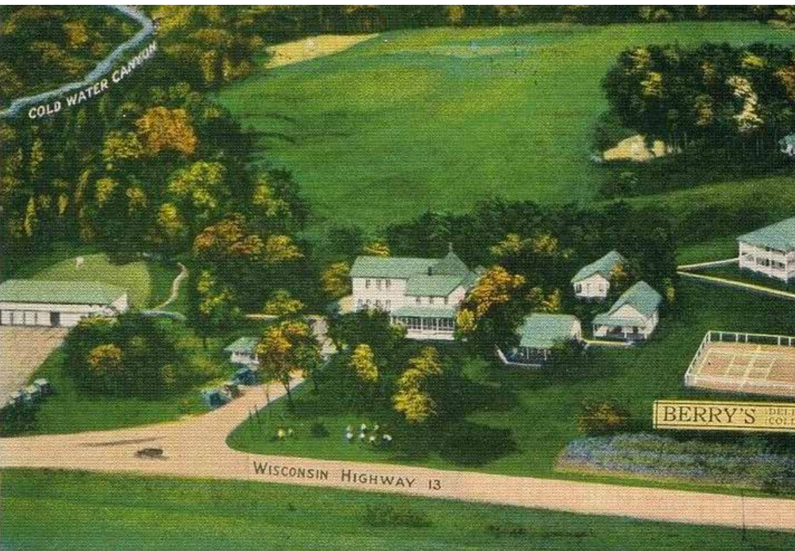
2½ MILES NORTH OF WISCONSIN DELLS, WIS.