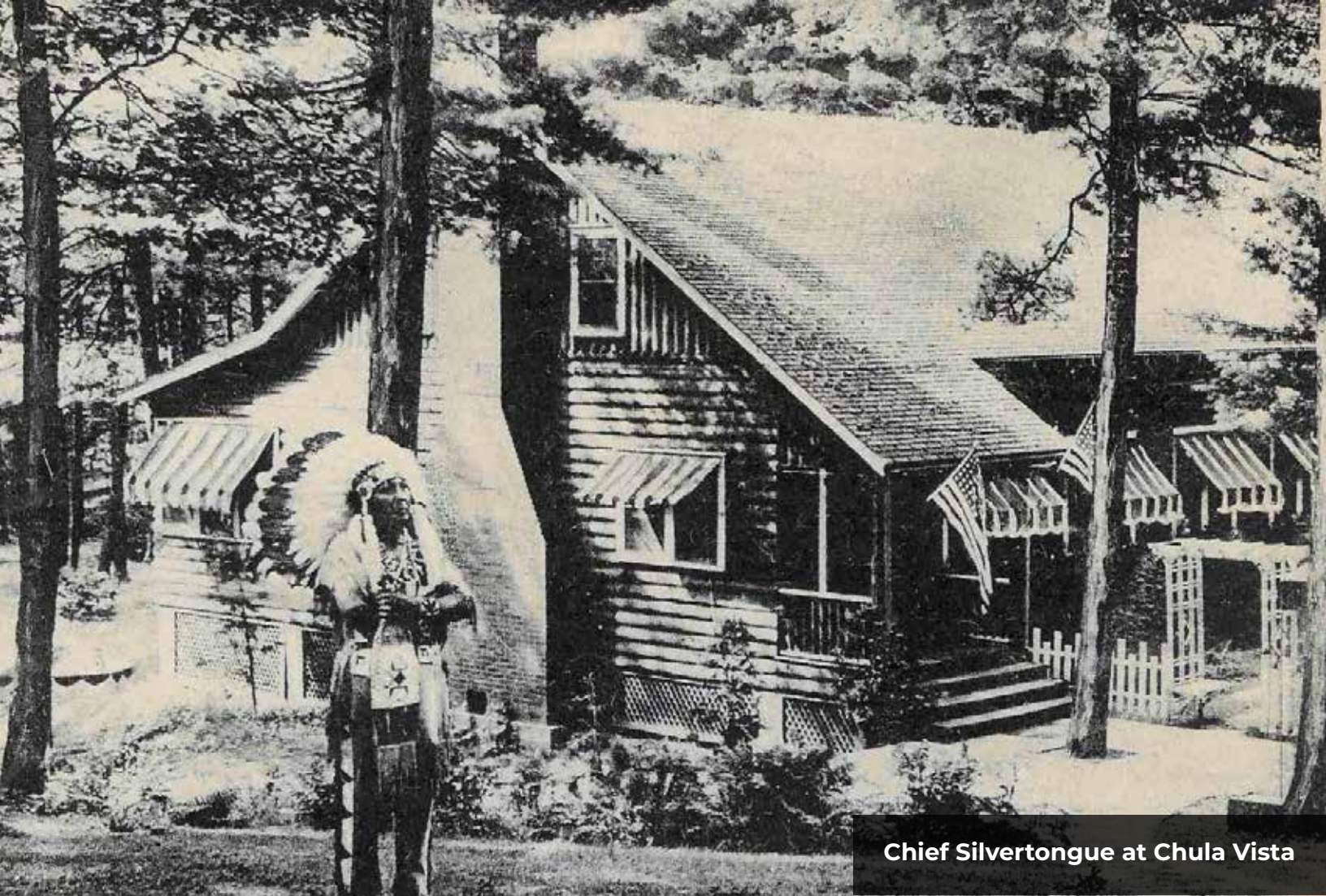
Chief Silvertongue at Chula Vista