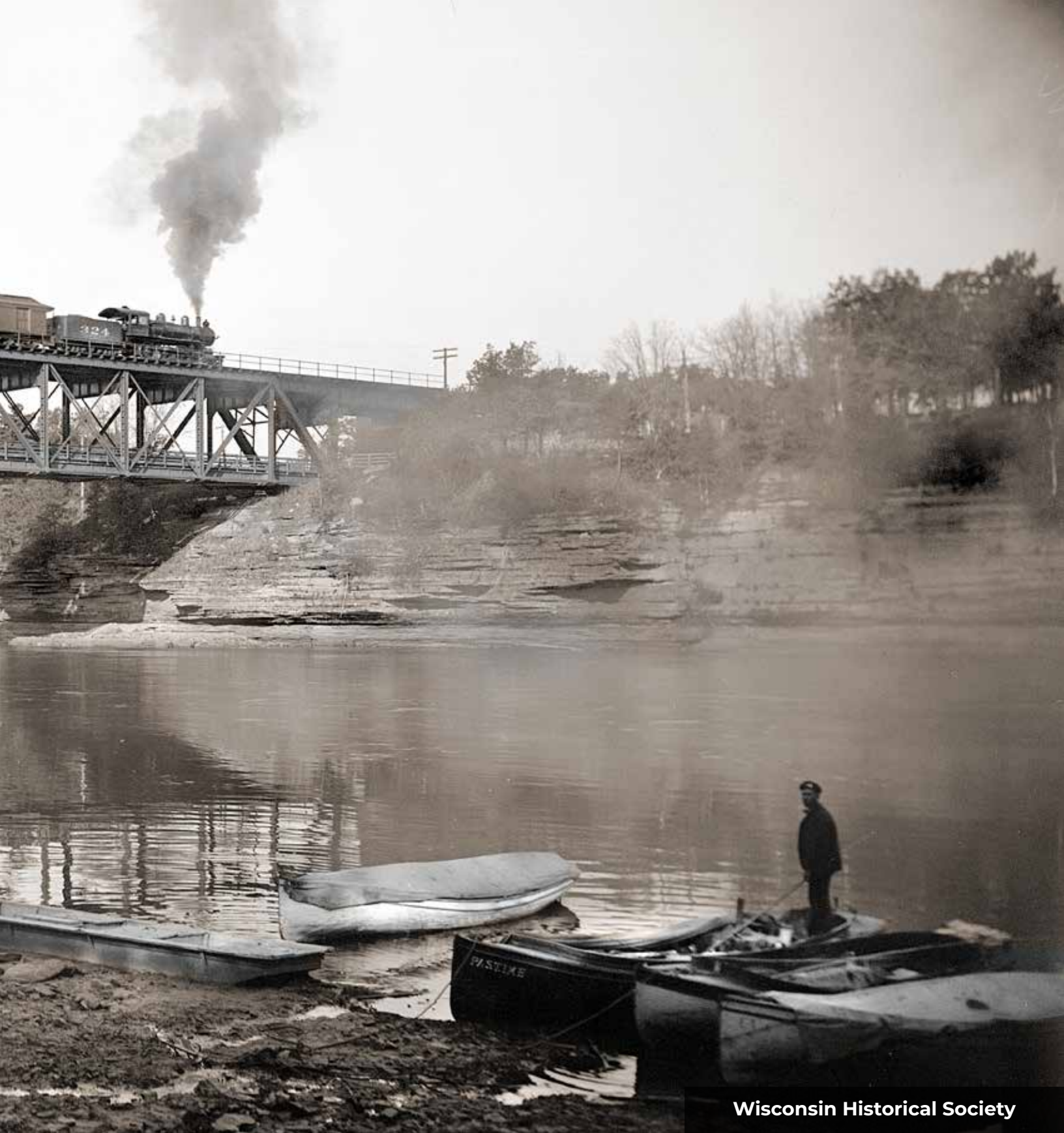
Wisconsin Historical Society